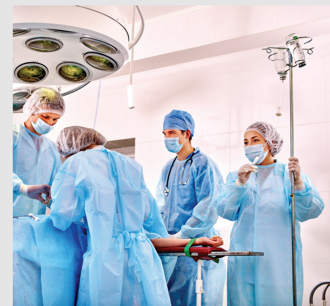
Plastic tubing for sensitive medical applications