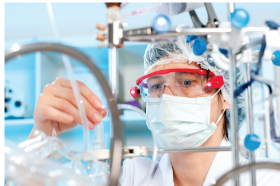
Both rigid and flexible tubing and profiles

PBS Plastics is a custom extrusion manufacturer of rigid and flexible plastic tubing and profiles.