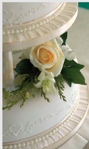
Plastic risers for cakes