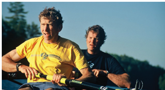
Cylindrical tube grips for oar handles

PBS Plastics is a custom extrusion manufacturer of rigid and flexible plastic tubing and profiles.